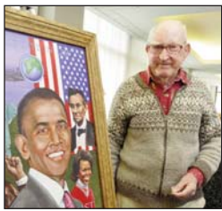
Patient crafts portrait page 4