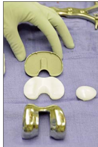
Above, a model of the knee, created from an MRI. Custom-fit knee replacements are now available at Backus.

She said she would recommend the procedure to others who qualify for it.