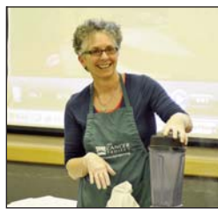
Cooking series page 6