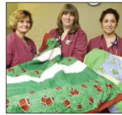
Quilts donated page 7